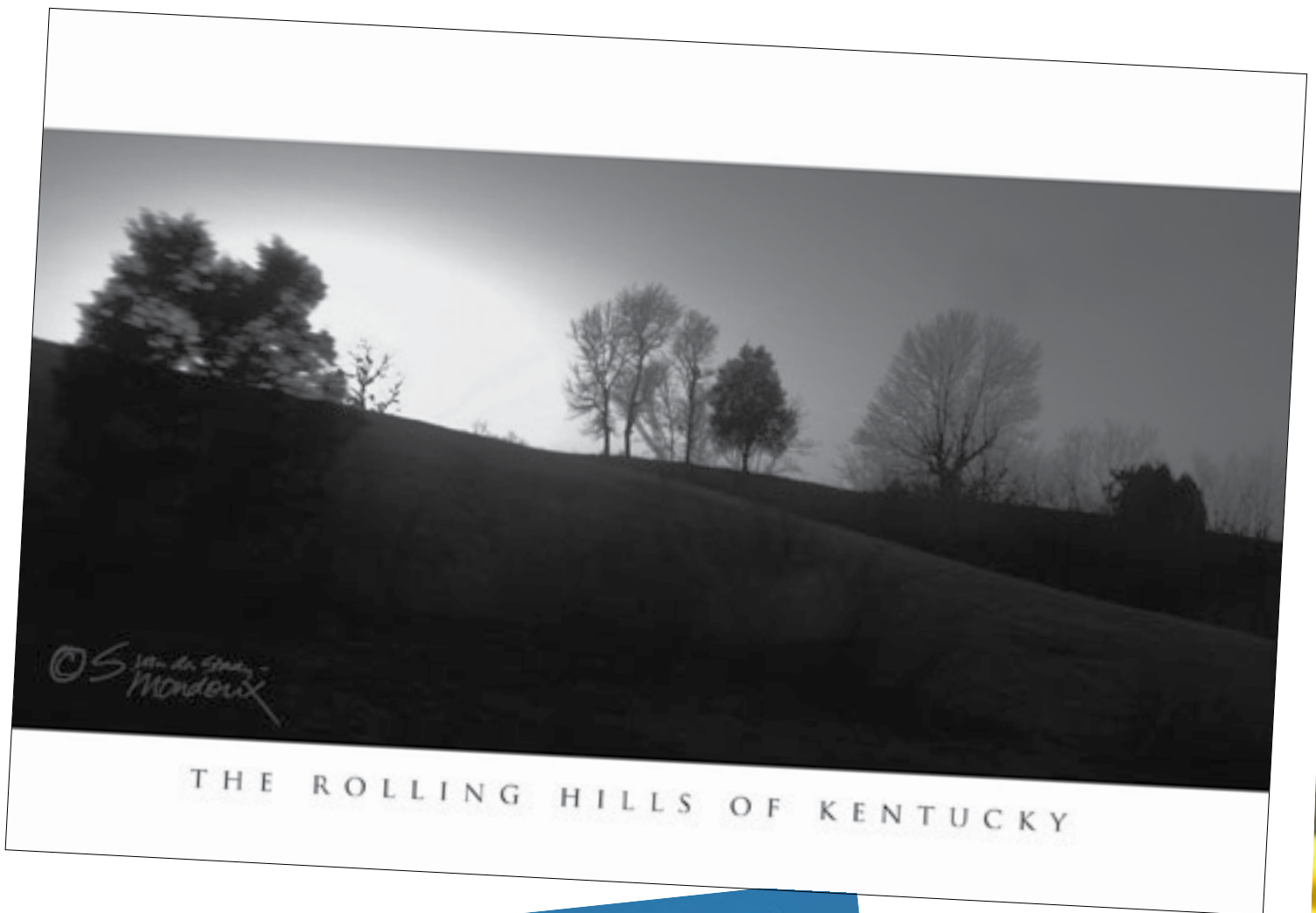
THE ROLLING HILLS OF KENTUCKY